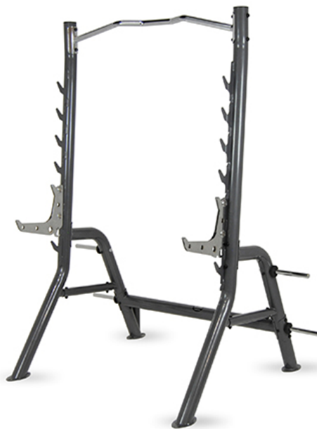
8 9 10 11 12 13 14 15 16 17 18 19 Defendants’ Squat Rack

4 31. Defendants have made, used, offered for sale, sold, and/or imported a 5 strikingly similar, infringing copy of Hoist’s squat rack product known as the Squat 6 Rack. As shown below, Defendants’ product misappropriates and copies Hoist’s 7 trade dress: