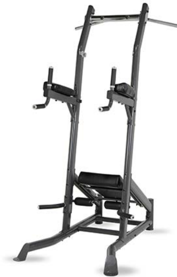
Defendants' VKR Chin/Dip Station