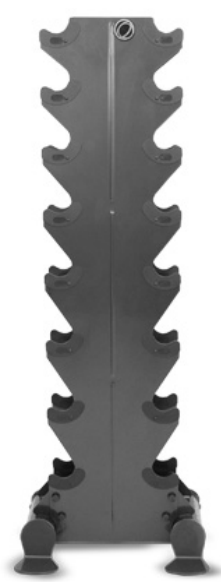
Defendants' Dumbbell Rack – VDB8