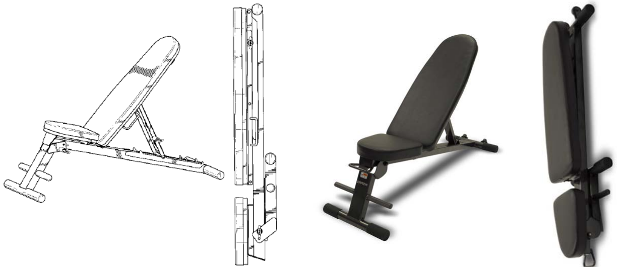
14 15 16 17 18 19 20 21 22 '585 Patent

10 24. Defendants have made, used, offered for sale, sold, and/or imported a 11 strikingly similar, infringing copy of Hoist's folding bench product known as the 12 Folding Bench - FLB1. As shown in the following side-by-side comparison, 13 Defendants' product misappropriates and copies Hoist's patented design: