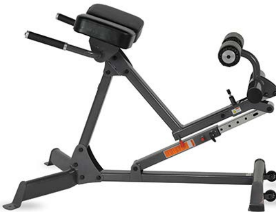
13 14 15 16 17 18 19 20 21 Defendants’ 45/90 Hyperextension Bench

9 37. Defendants have made, used, offered for sale, sold, and/or imported a 10 strikingly similar, infringing copy of Hoist’s incline/decline bench product known 11 as the 45/90 Hyperextension Bench. As shown below, Defendants’ product 12 misappropriates and copies Hoist’s trade dress: