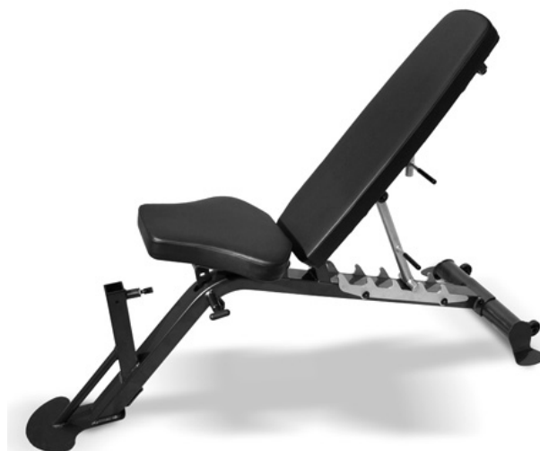
Defendants' SCS Bench – SCS-WB HOIST ROMAN HYPER

1 2 3 4 5 6 7 8 9 10 11 12 13 14 15 16 17 18 19 20 21 22 23 24 25 26 27 28